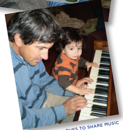
OUR FAMILY LOVES TO SHARE MUSIC